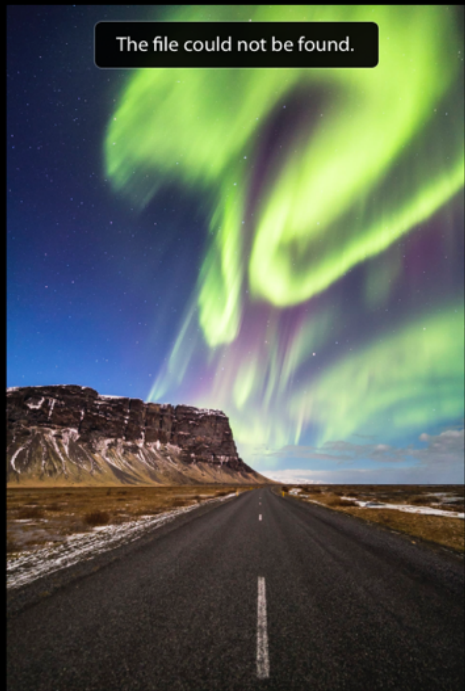
Photo is missing