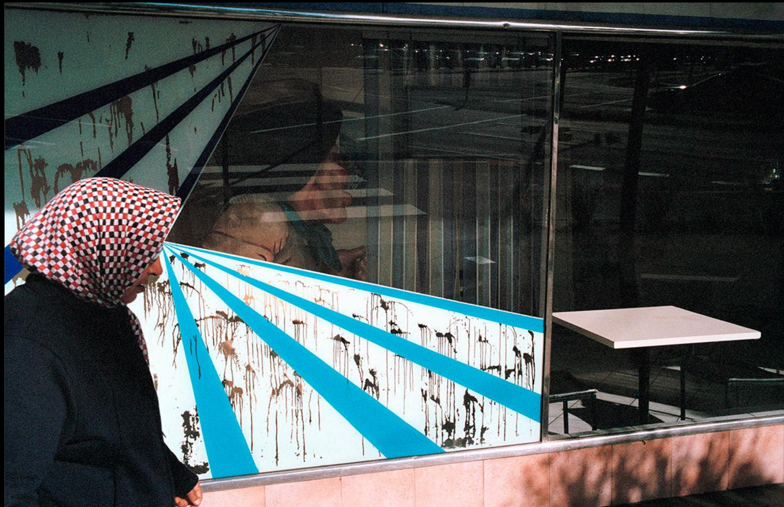
Laser Vision