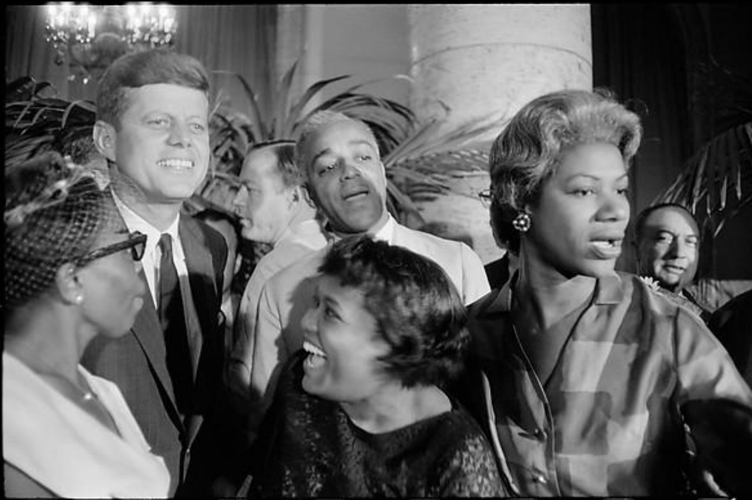
John F. Kennedy, Democratic National Convention, Los Angeles Garry Winogrand (American, 1928–1984)