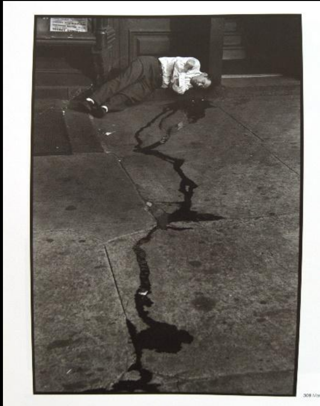
Manhattan, New York, USA 1947