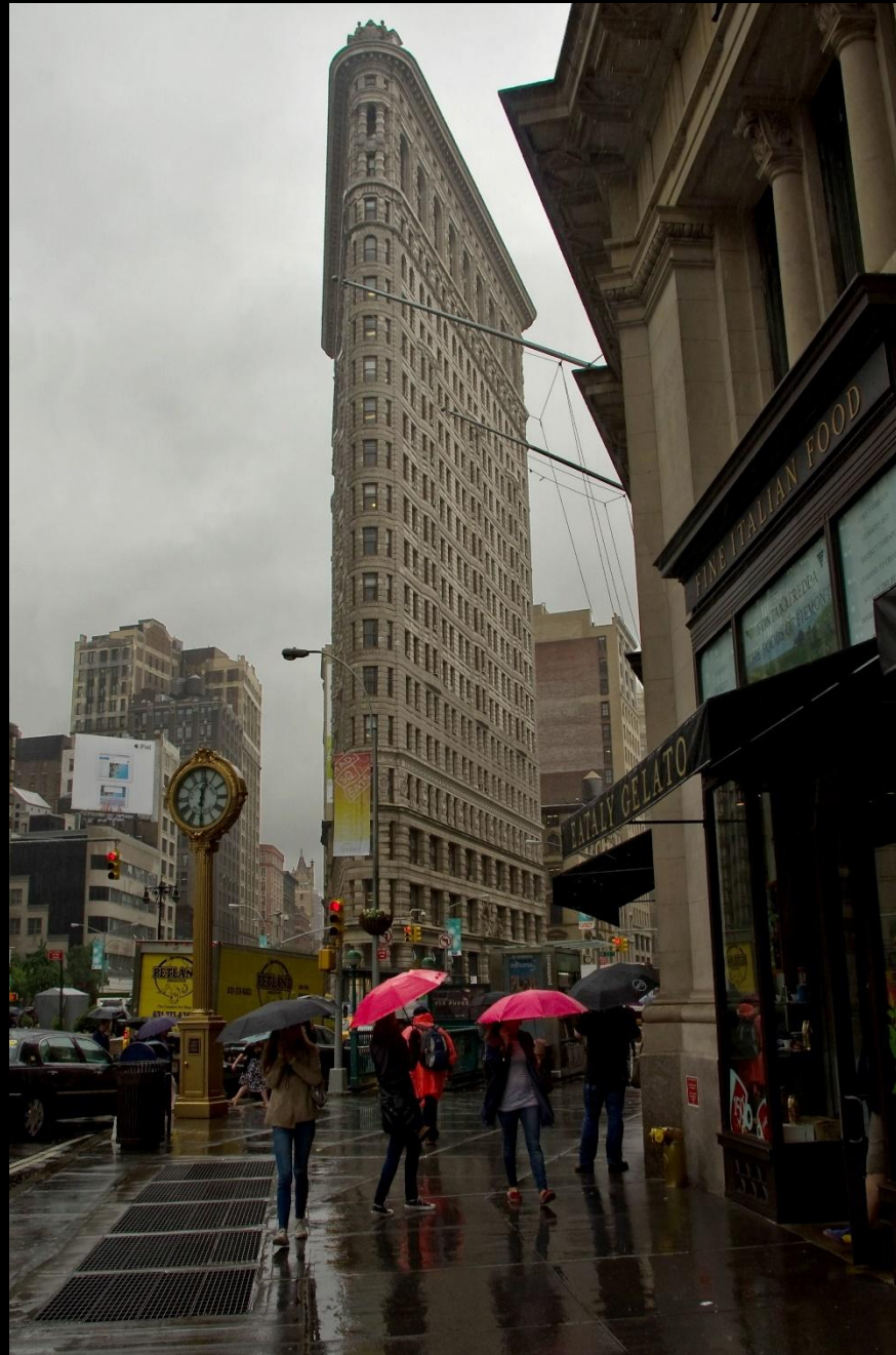
Flatiron Building, New York 2013 Wolf Marx